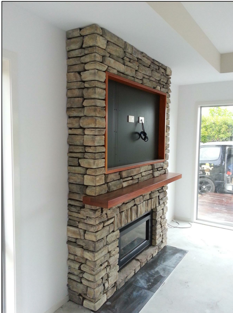
Picture frame TV recess using paint quality timber facing or similar. Rebate to suit TV size requirements. Back of recess can be painted black to give shadow or negative detail effect.